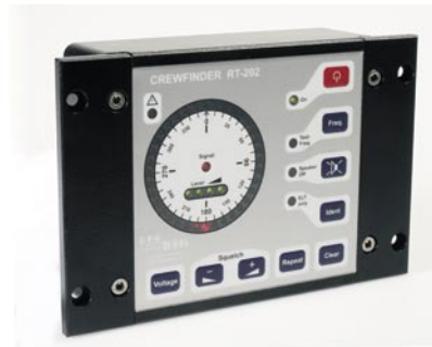
Aluminum housing with panel mounting brackets