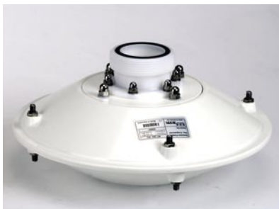
Screw flange (standard)