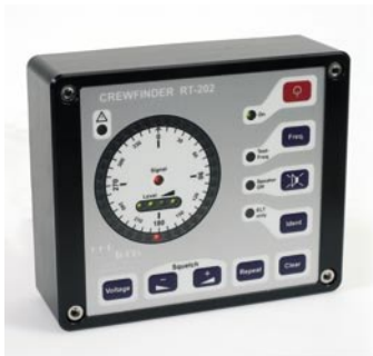
POM housing (standard)