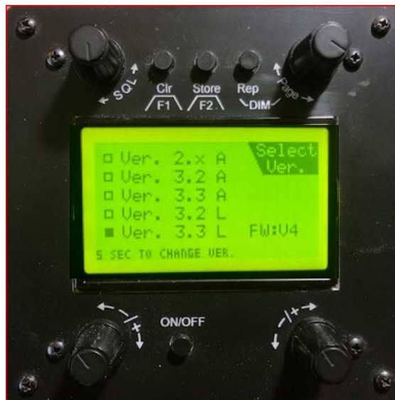
Version Select Page

Select Ver. 3.3 L for 2 nd generation DCU Trainer Law Enforcement version