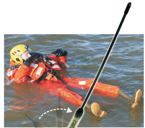
90° antenna for horizontal mounted beacon